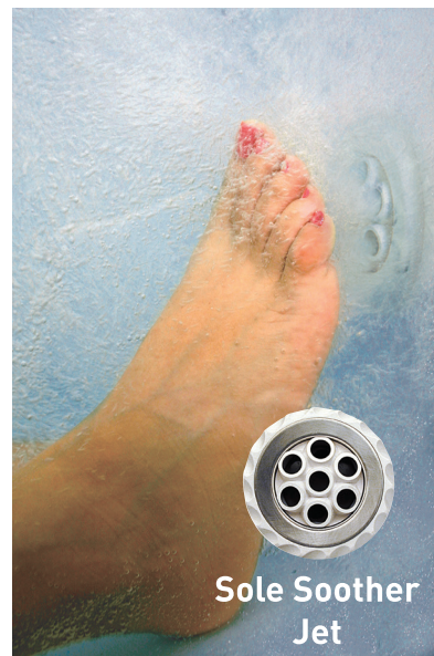
Sole Soother Jet

A FOOT MASSAGE helps improve your well being.