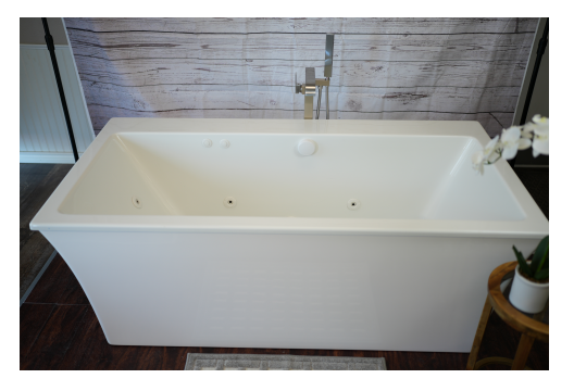
TECHNICAL SPECIFICATIONS Side drain