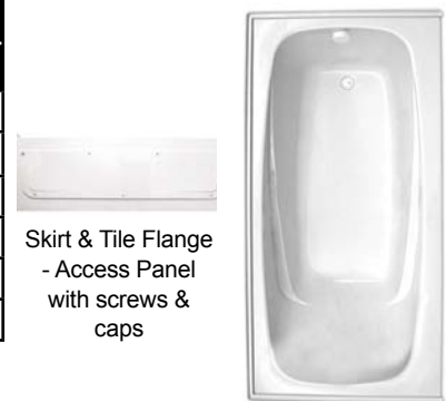
Skirt & Tile Flange - Access Panel with screws & caps