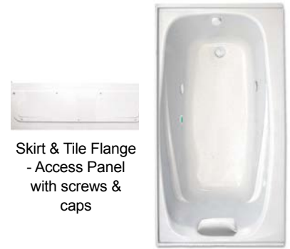
Skirt & Tile Flange - Access Panel with screws & caps