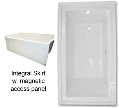
Integral Skirt w magnetic access panel